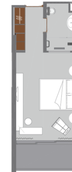
LOUIS ivi mare